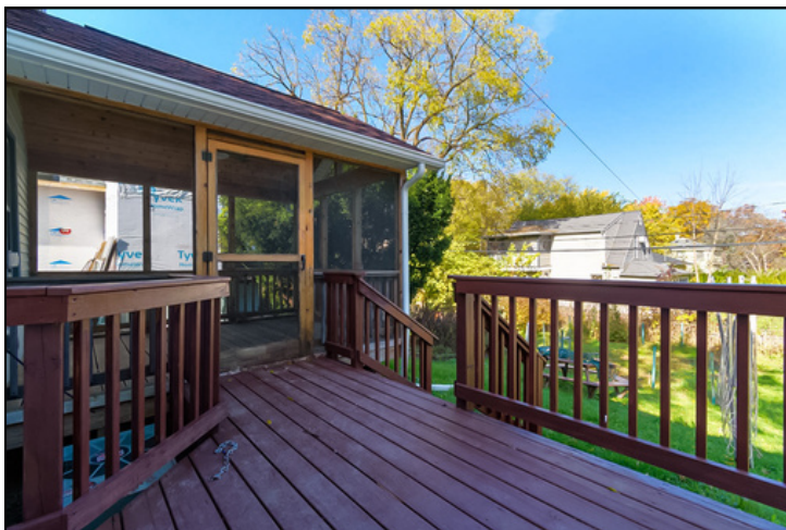
Exterior backporch view