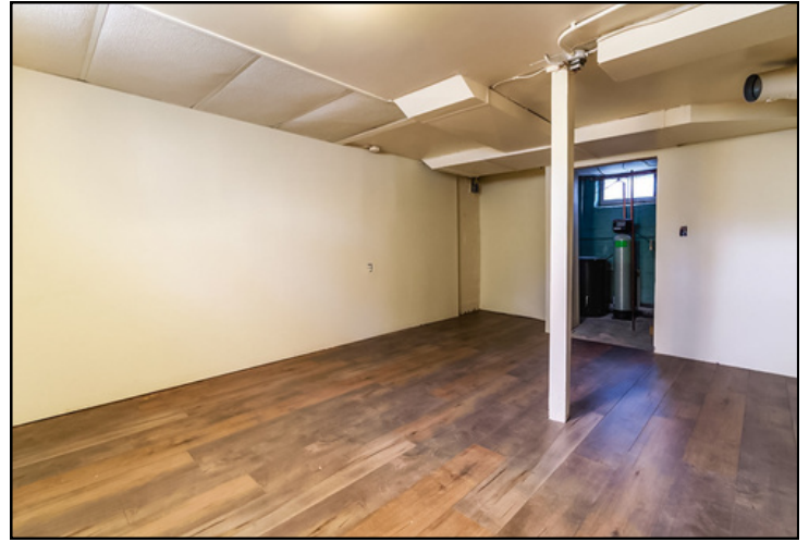
Partially finished basement