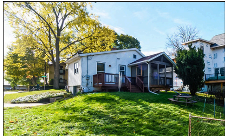
Exterior backyard view