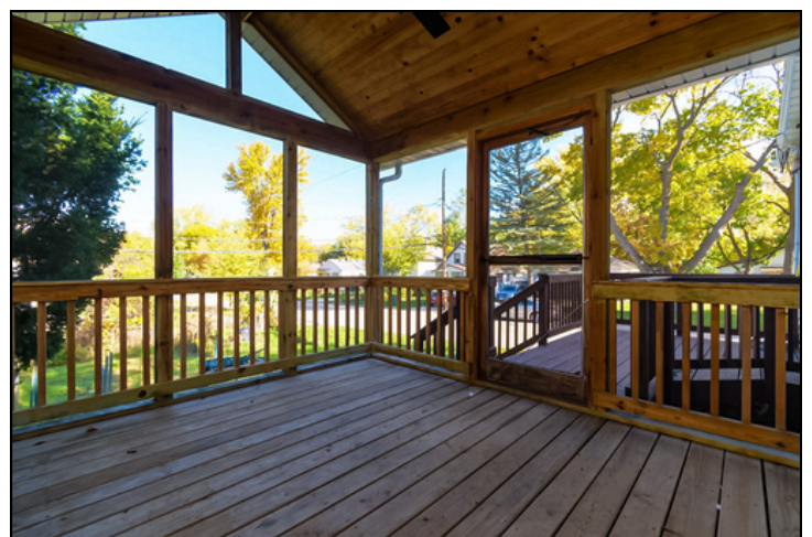
Screen porch located on back of house.