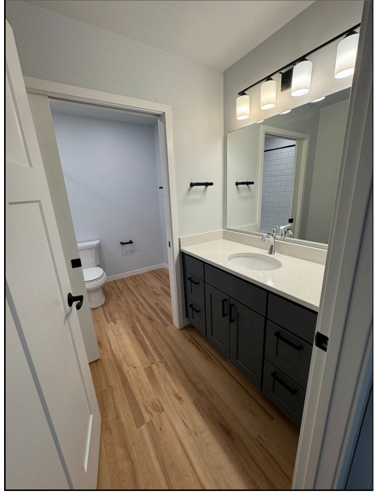
Second Floor Bathroom