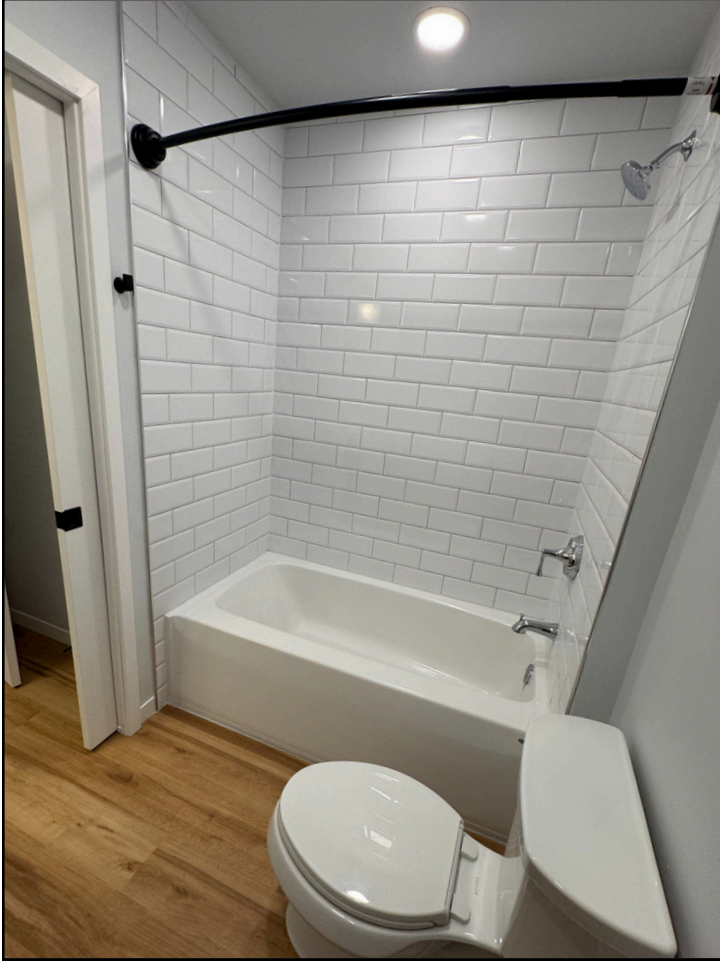
Second Floor Bathroom