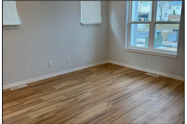
Great Room View 1