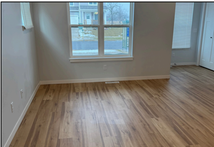
Great Room View 2