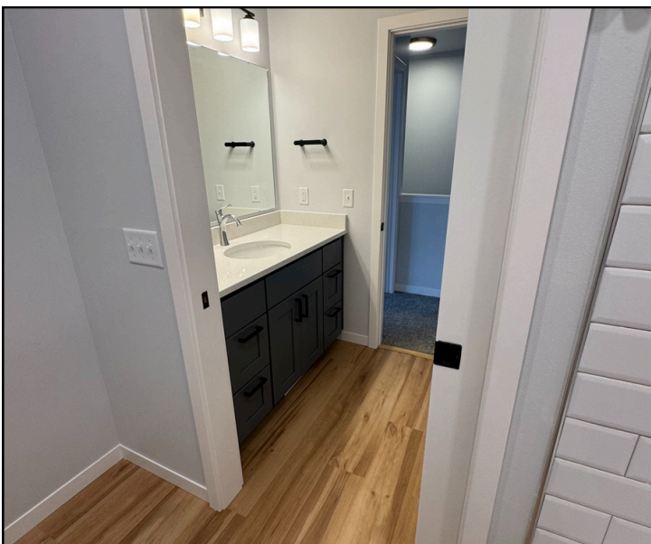
Second Floor Bathroom