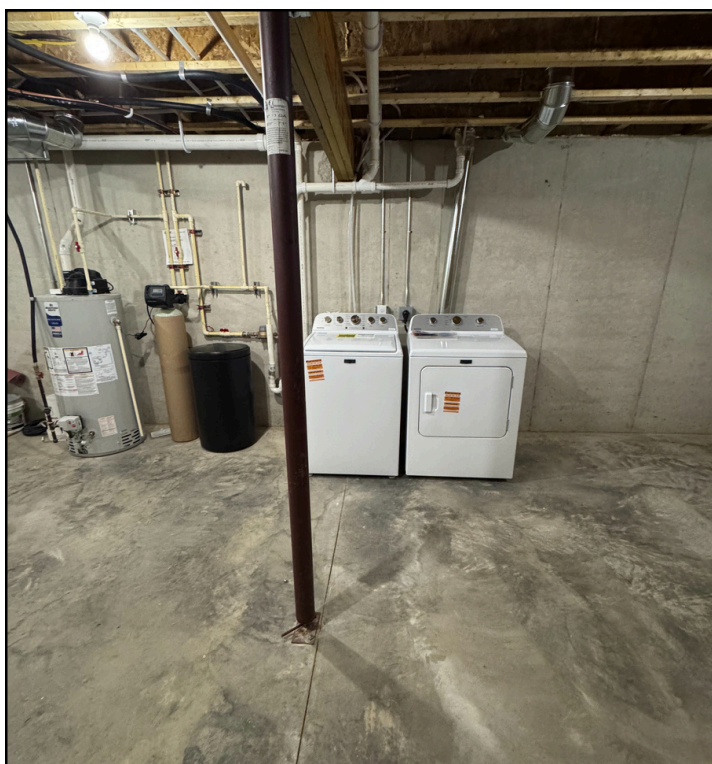
Basement Washer & Dryer

Tours of 5173 Great Gray Drive are available by request at housing@maclt.org