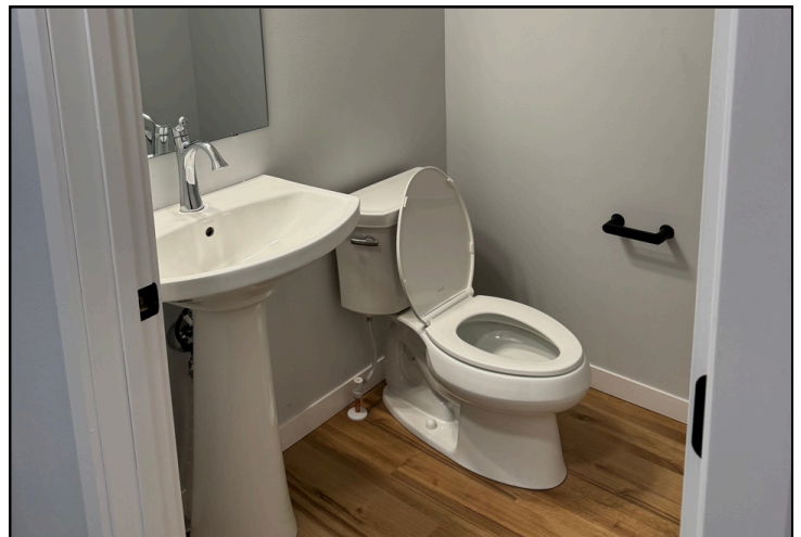
First Floor Bathroom